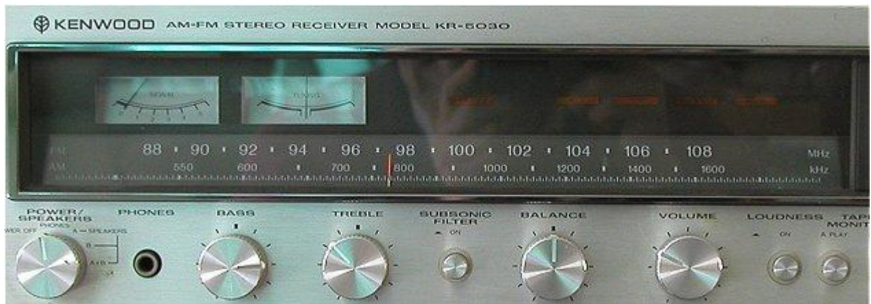
My Dad's 1970s Kenwood AM-FM Stereo Receiver.

b) Give the wavelengths in meters to three significant figures for Blue Ridge Public Radio WCQS 88.1 FM (Classical Music, News, Talk) and WISE 1310 AM (Sports).