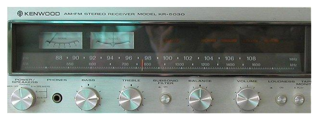
My Dad's 1970s Kenwood AM-FM Stereo Receiver.

b) Give the wavelengths in meters to three significant figures for Blue Ridge Public Radio WCQS 88.1 FM (Classical Music, News, Talk) and WISE 1310 AM (Sports).